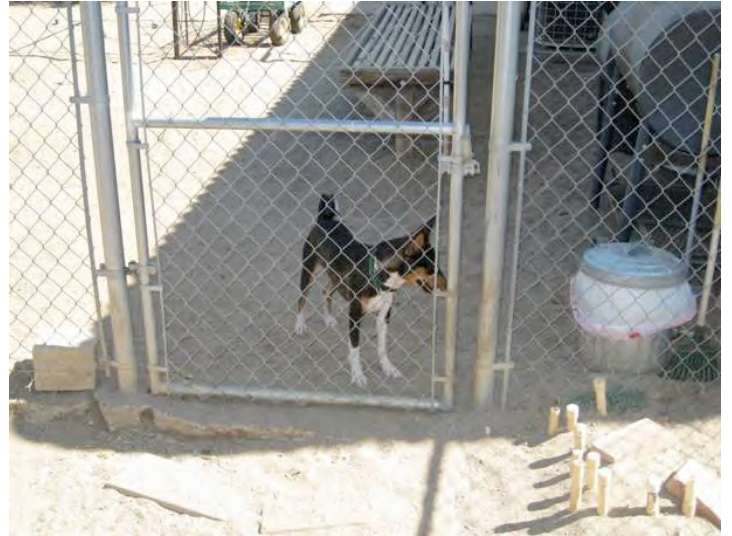
Hanging out in the back this morning (Friday 5-22)