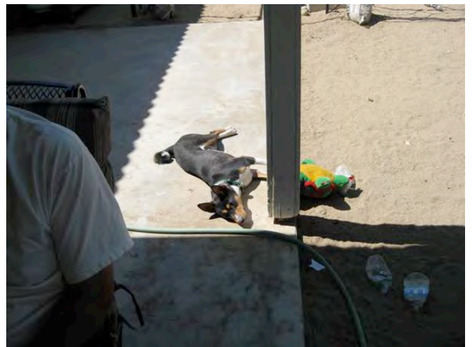
Momentarily mellow after a lot of fetching and a walk up the hill.